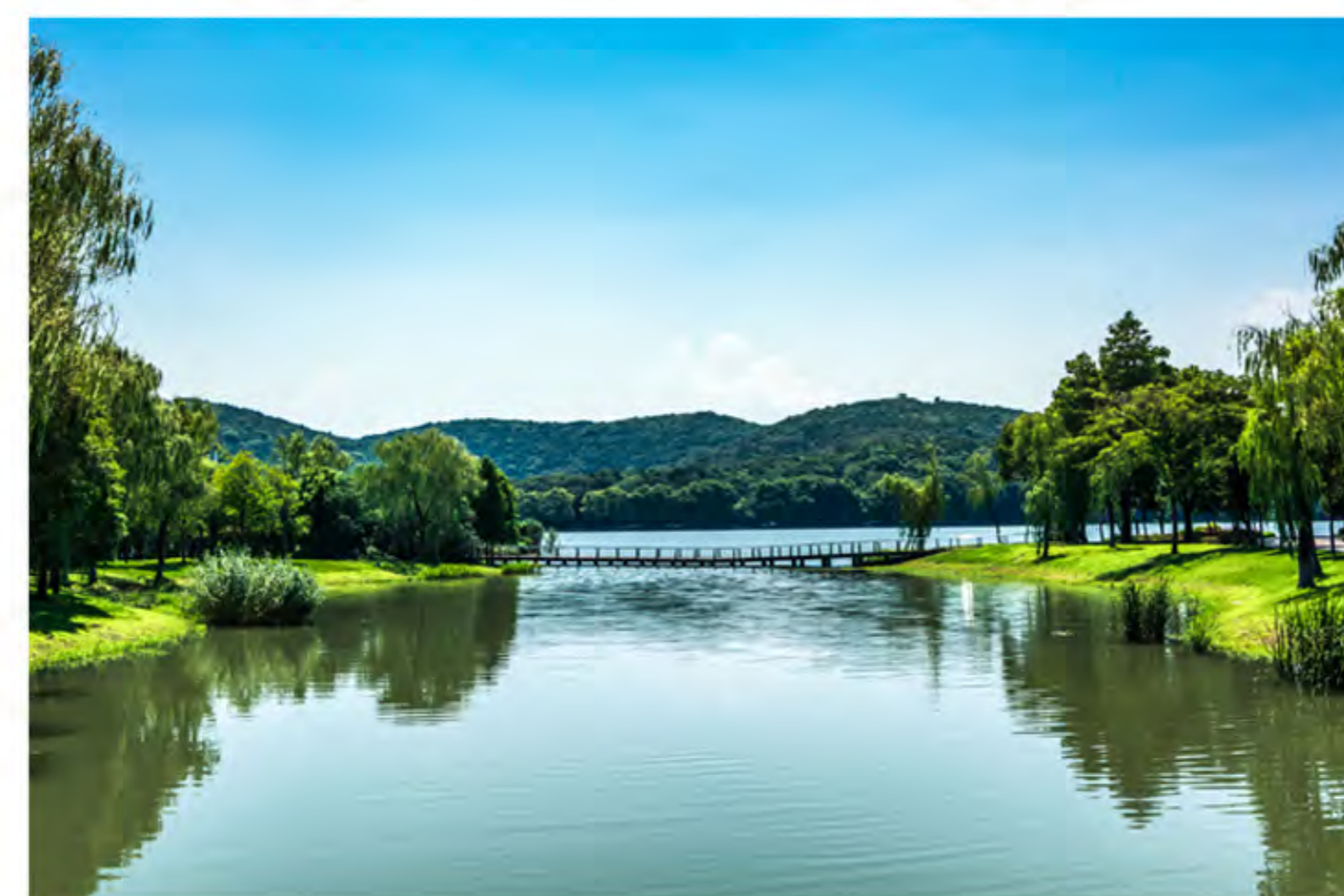
Scenic Man-made Lake