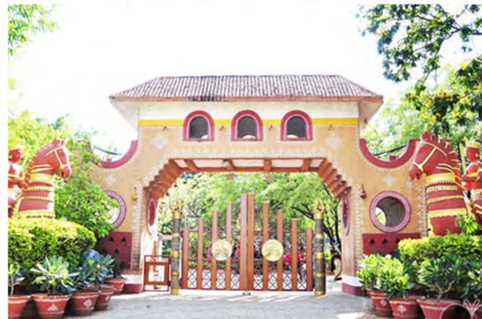
Proposed Mini Shilparamam