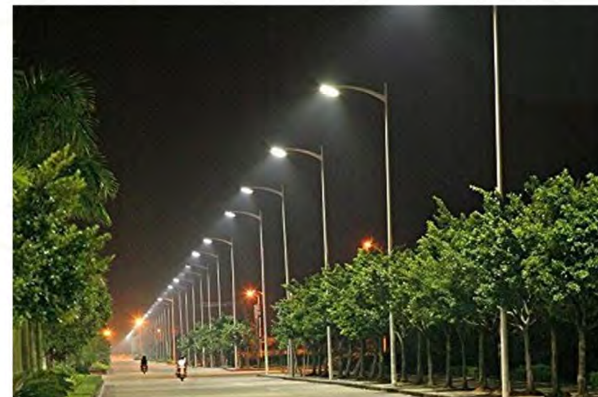
24/7 Power Supply