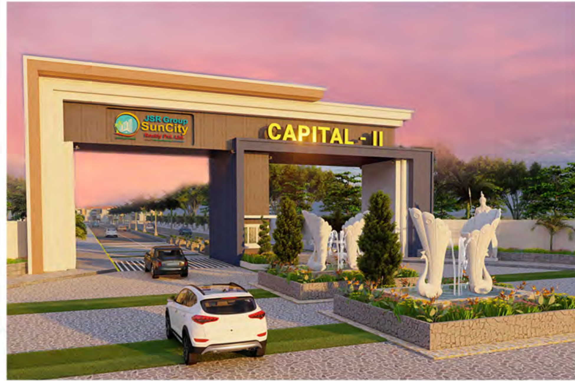
24/7 Security with Maintenance