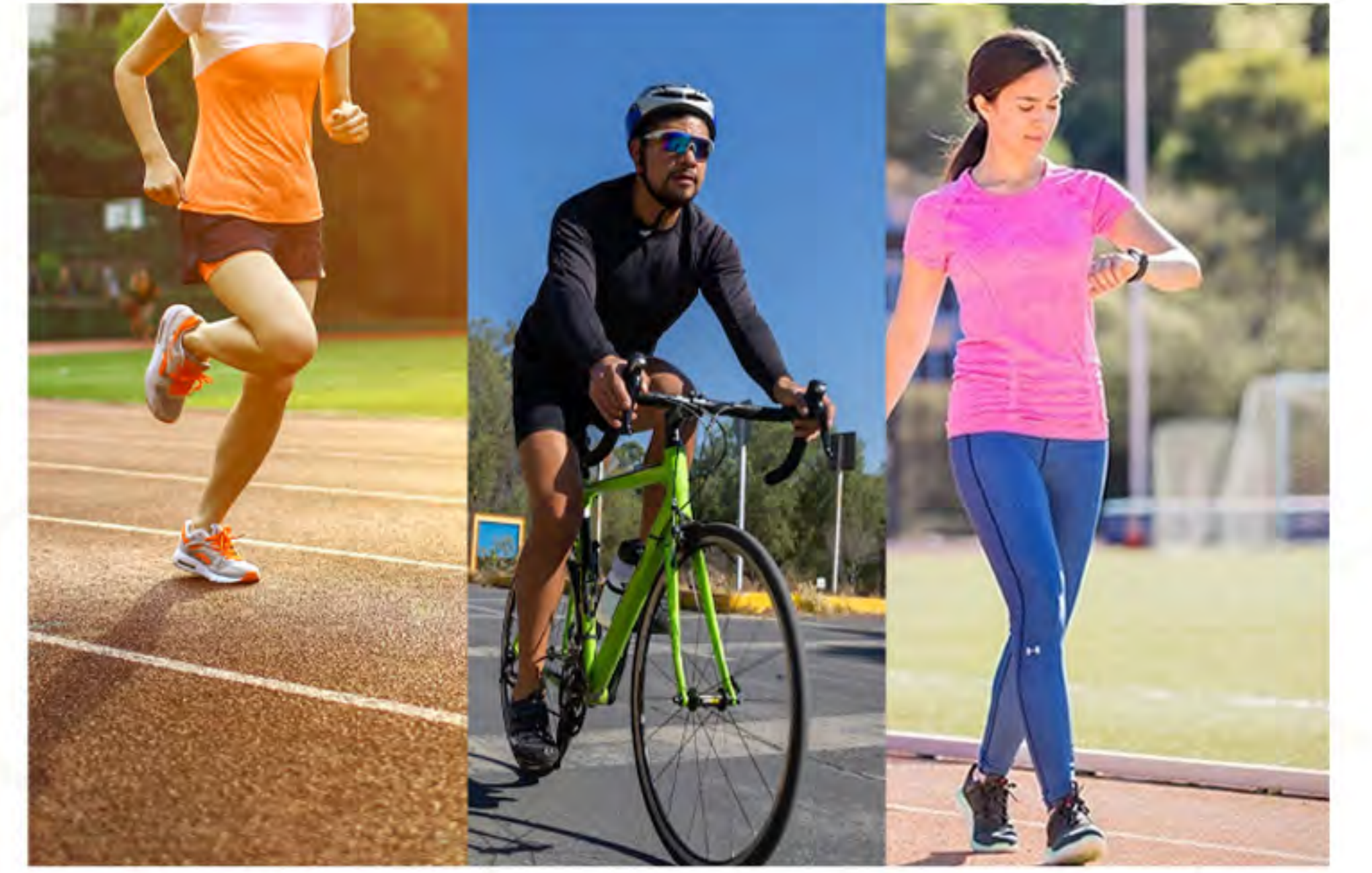
Walking, Jogging and Cycling Tracks