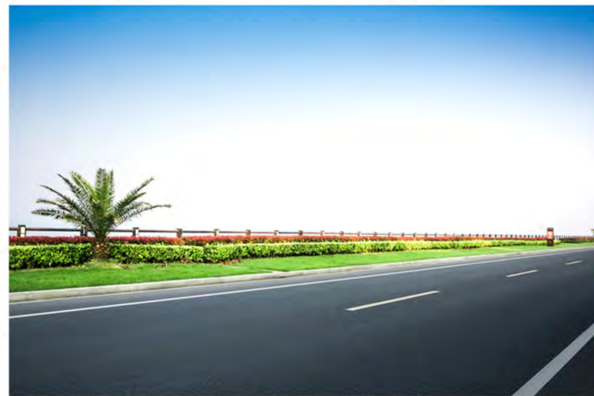
Formation of 60', 40' & 33' feet Black top wide Roads.