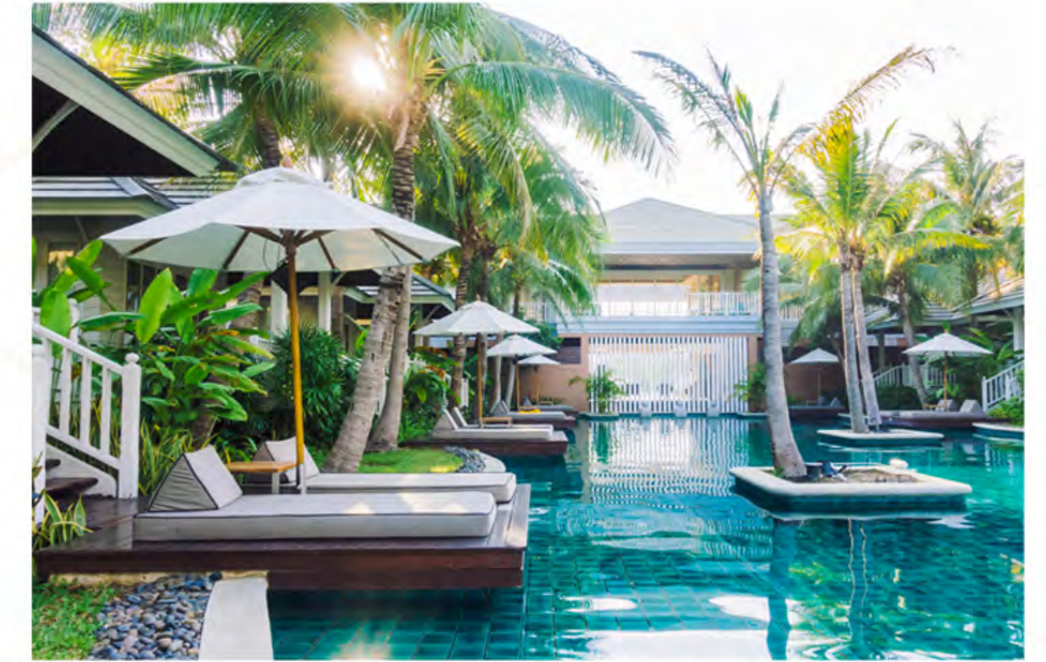
Proposed Green Resort