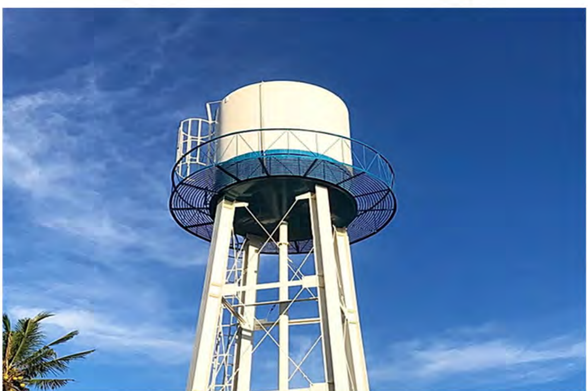
Overhead Water Tank